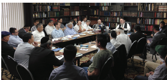
Rosh HaYeshiva's Pre-Pesach shiur