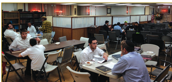
Weekly Beis Midrash at Young Israel of Bal Harbor

An important component of the Kollel is focused on the community, offering shiurim at various locations throughout the South Florida area. In addition, there are Yarchei Kallah programs which draw many community members to study and confront halachic issues that are rarely part of one's Yeshiva experience, yet important in everyday life.